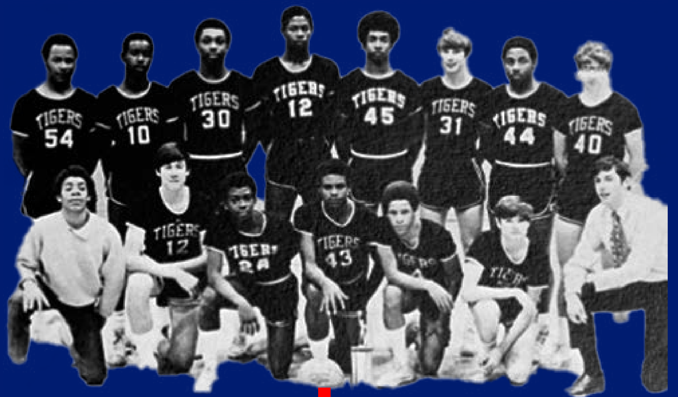
1969-70, Chapel Hill